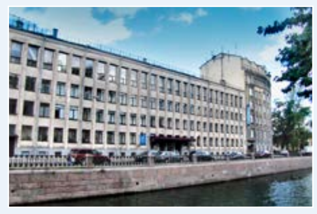
Saint-Petersburg Banking School (College) of the Bank of Russia

One of key activities of the Saint-Petersburg Banking School (College) is retraining and professional development of employees working in regional branches, national banks and the Bank of Russia organisations.