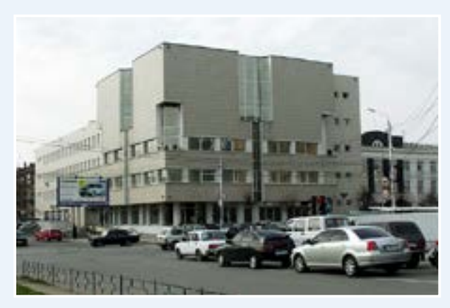
The Interregional Training Centre The Bank of Russia (Tula)

The Interregional Training Centre was established in 1996 to enhance qualifications of the Bank of Russia personnel in important banking areas.