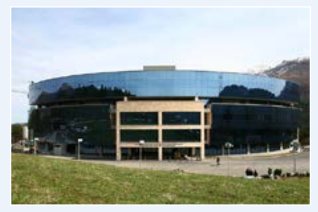
Training and Research Centre of the Central Bank of the Republic of Armenia (Dilijan)

Training and Research Centre of the Central Bank of the Republic of Armenia is located in the town of Dilijan which is a mountain and balneotherapeutic health resort, 1250-1500 metres above the sea level and 110 km from Yerevan.