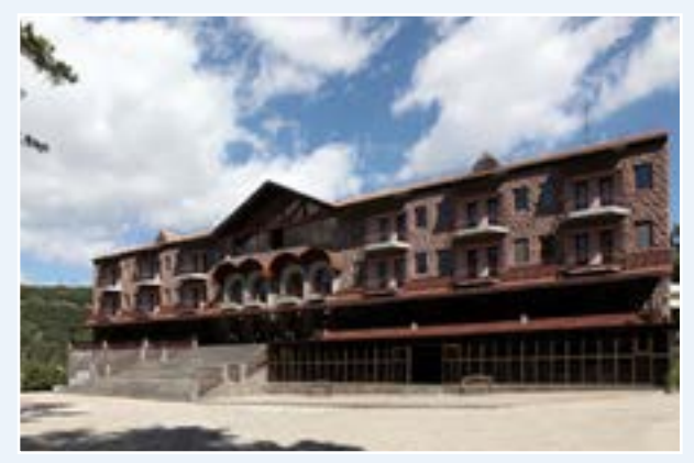
Training Centre of the Central Bank of the Republic of Armenia (Tsakhkadzor)

The Training Centre is a structural unit of the Central Bank of the Republic of Armenia.