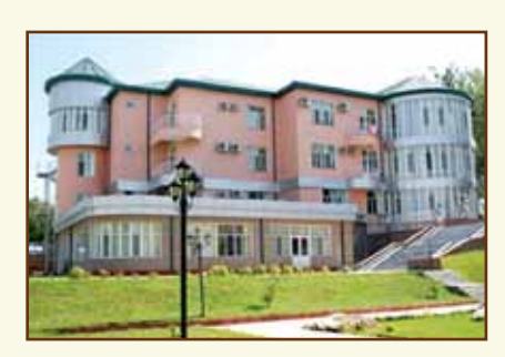
Kayrakkum Training and Health-Recreation Centre of the National Bank of Tajikistan