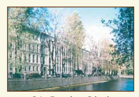
Saint Petersburg School of Banking (College) of the Bank of Russia