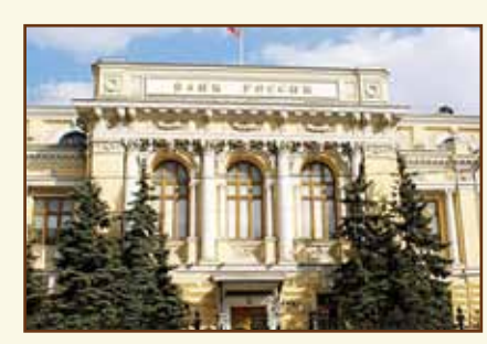
Central Bank of the Russian Federation (Bank of Russia) Main Building