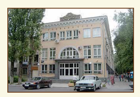
National Bank of the Kyrgyz Republic Main Building

Fax: (996 312) 61 – 52 – 79 E-mail: oevlashkova@nbkr.kg