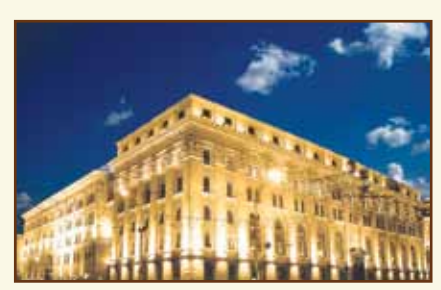
National Bank of the Republic of Belarus Main Building

Phone: (375 17) 219 – 24 – 00 Fax: (375 17) 222 – 39 – 95 E-mail: a.kulinkovich@nbrb.by