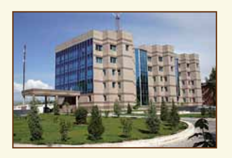
National Bank of Tajikistan Main Buildung

734003, Republic of Tajikistan, Dushanbe, Rudaki av., 107a Fax: (992 44) 600 – 32 – 35