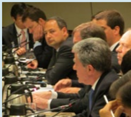
Meeting of FATF Ministers, adoption of the renewed FATF Mandate Washington, April 2012