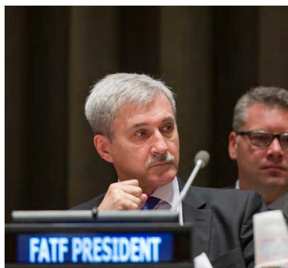
FATF President Vladimir Nechaev at the Open Briefing by the UN Security Council Sanctions Committees and the FATF, November 2013.

The FATF and the relevant bodies of the United Nations will continue to work closely to provide practical guidance on the implementation of targeted financial sanctions.